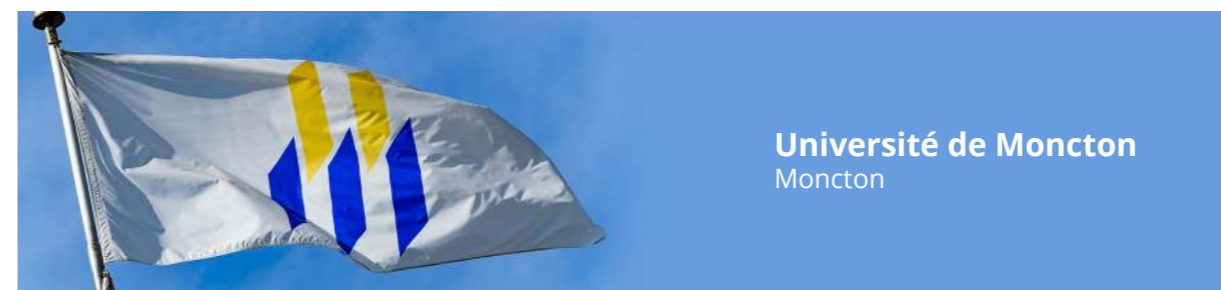
Université de Moncton Moncton